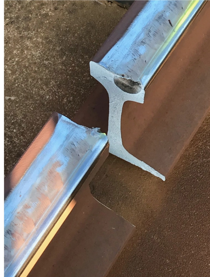
Rail Break and Defect