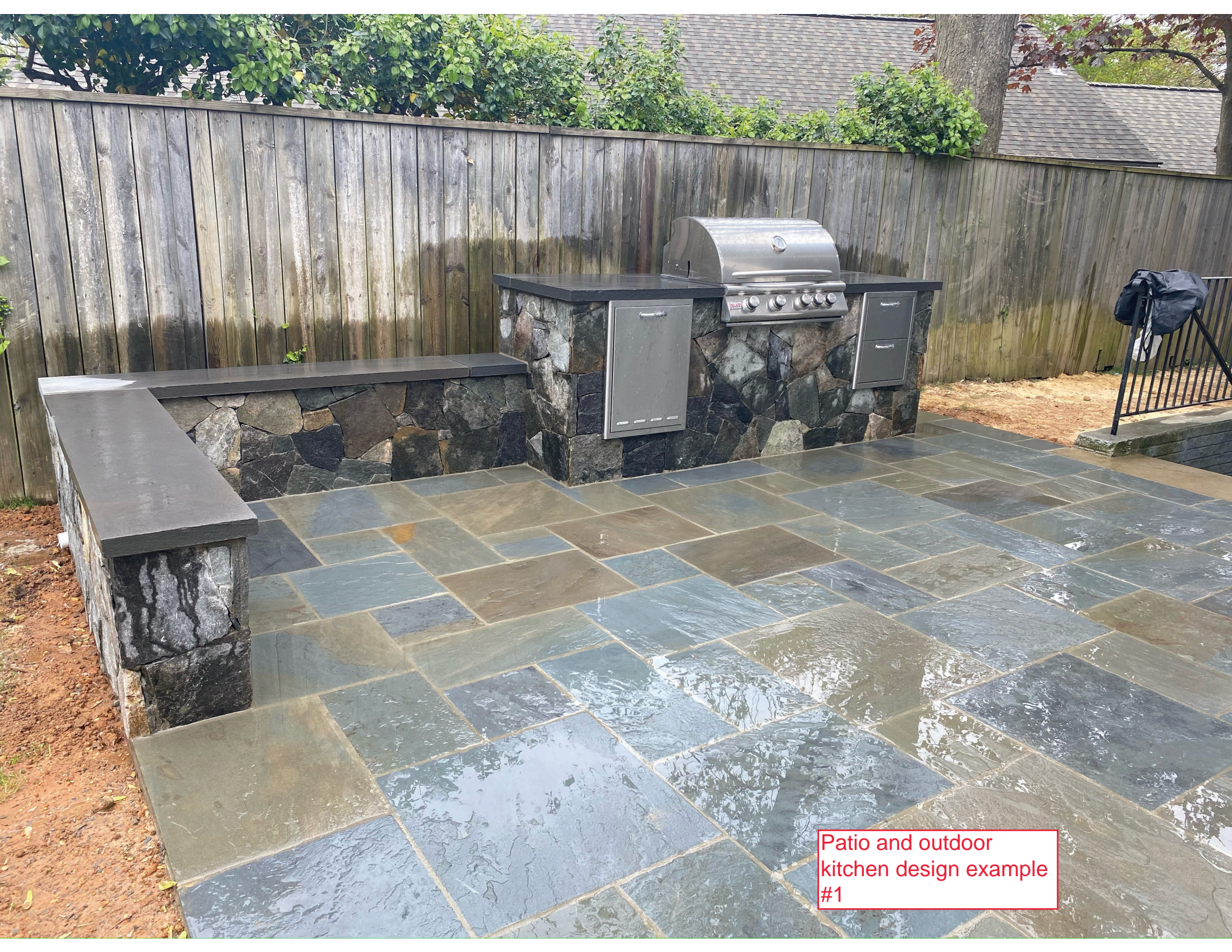
Patio and outdoor kitchen design example #1