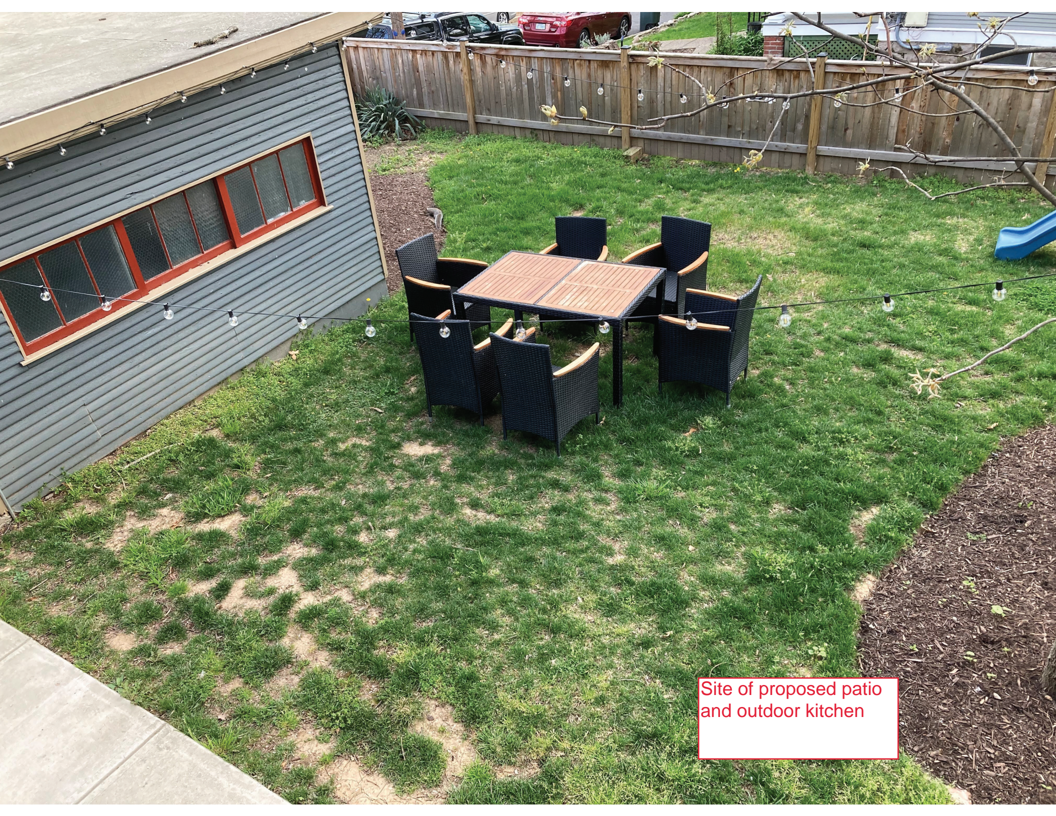
Site of proposed patio and outdoor kitchen