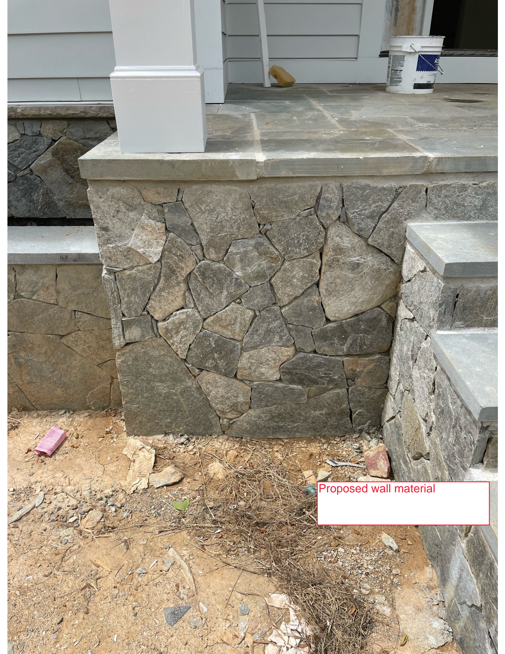
Proposed wall material