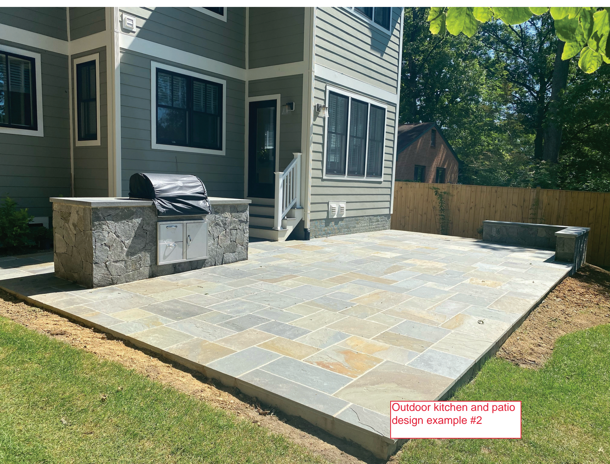
Outdoor kitchen and patio design example #2