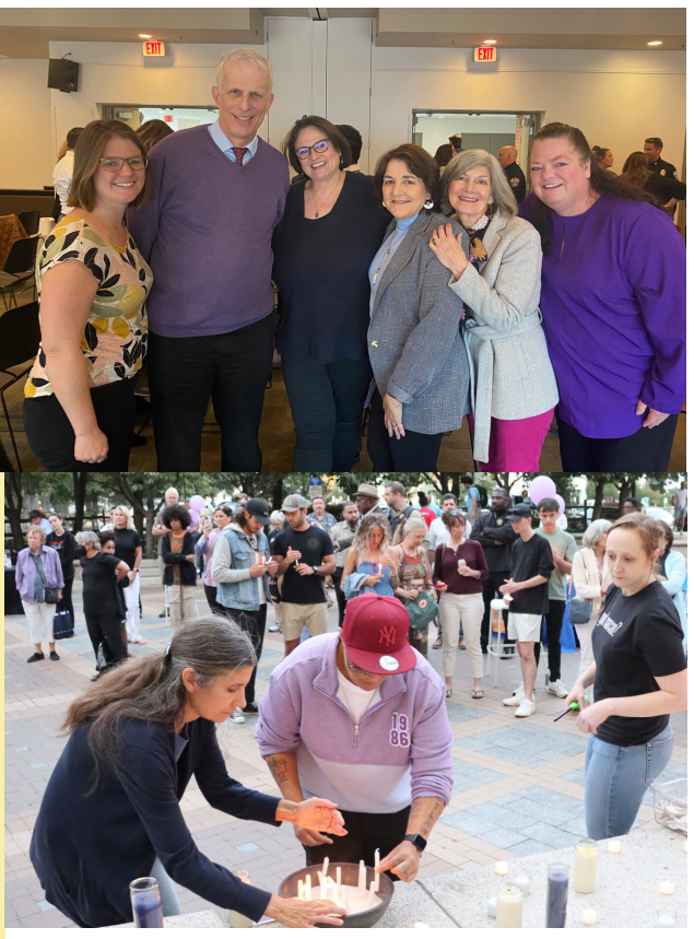
2023 By The Numbers:

The Virginia Association of Counties (VaCo) awarded us an Achievement Award in August! We were honored with the County Managers' Excellence Award in February!