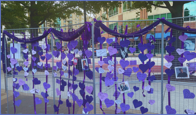
3rd Annual International Overdose Awareness Vigil

Thank you to everyone who participated in the 3rd annual overdose vigil. We joined together on September 4th to remember those who have lost their lives to overdose and to honor family and friends impacted by overdose.