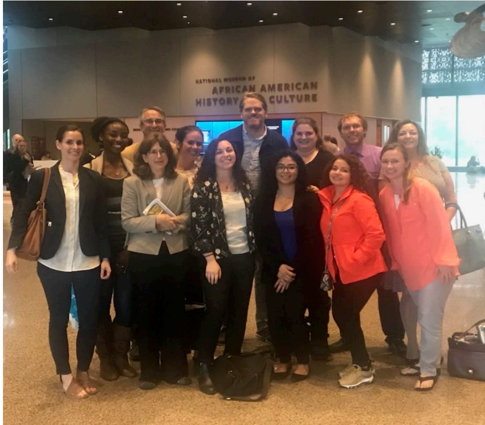
2019 office “field trip” to the African American History Museum