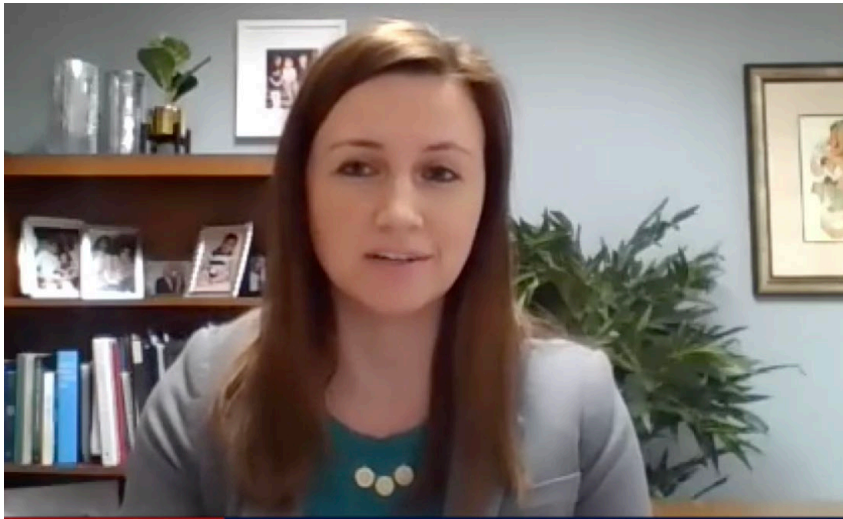
ALLISON CARPENTER/POLICE PRACTICES WORK