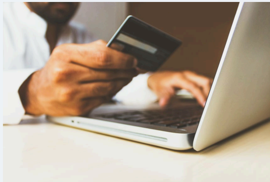
Enterprise Payment Solution