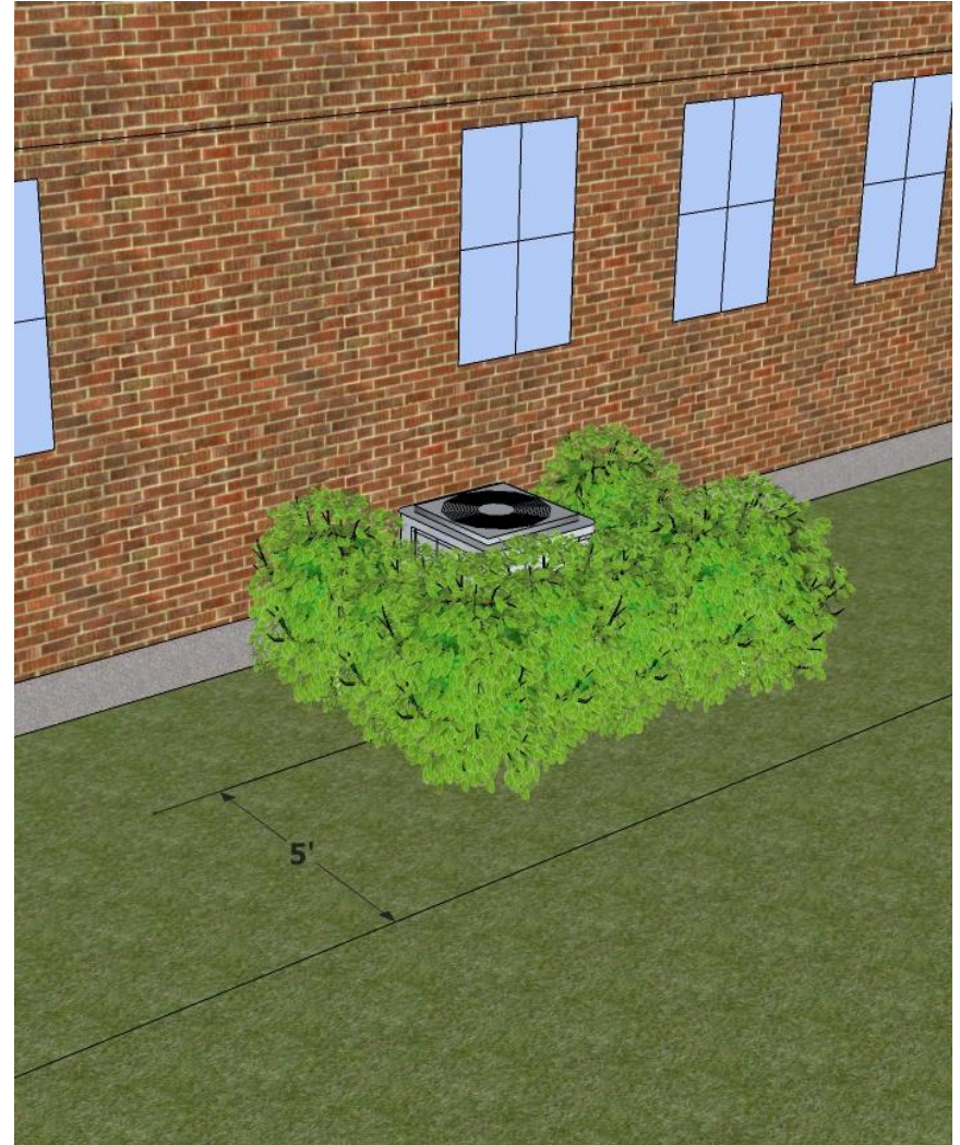
Screening with vegetation