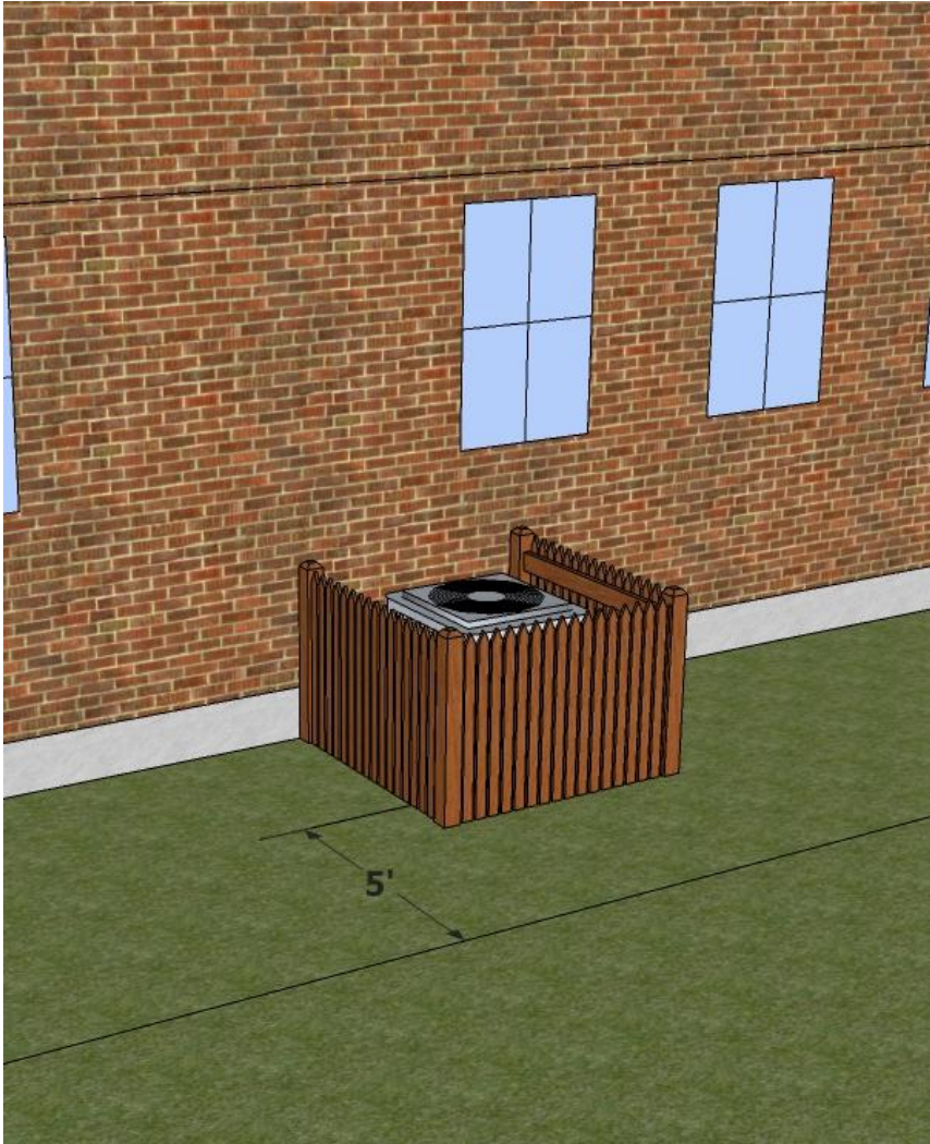
Screening with fence