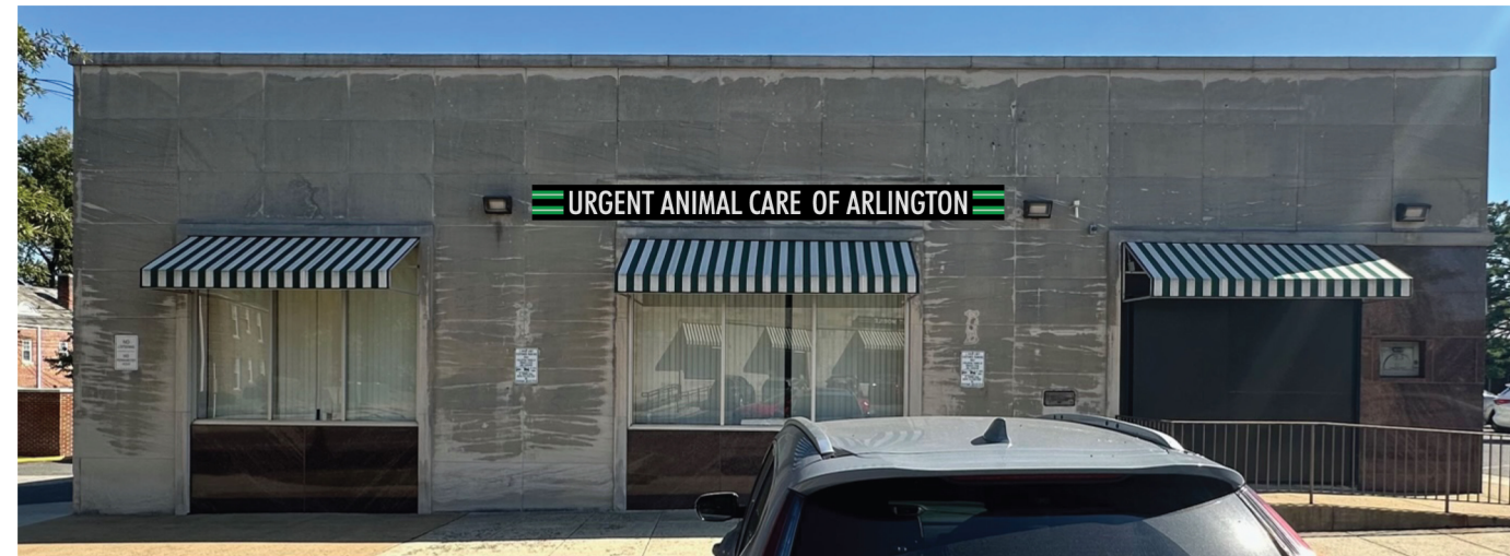
PROPOSED SIGNAGE - VIEW FROM N. PERSHING DR