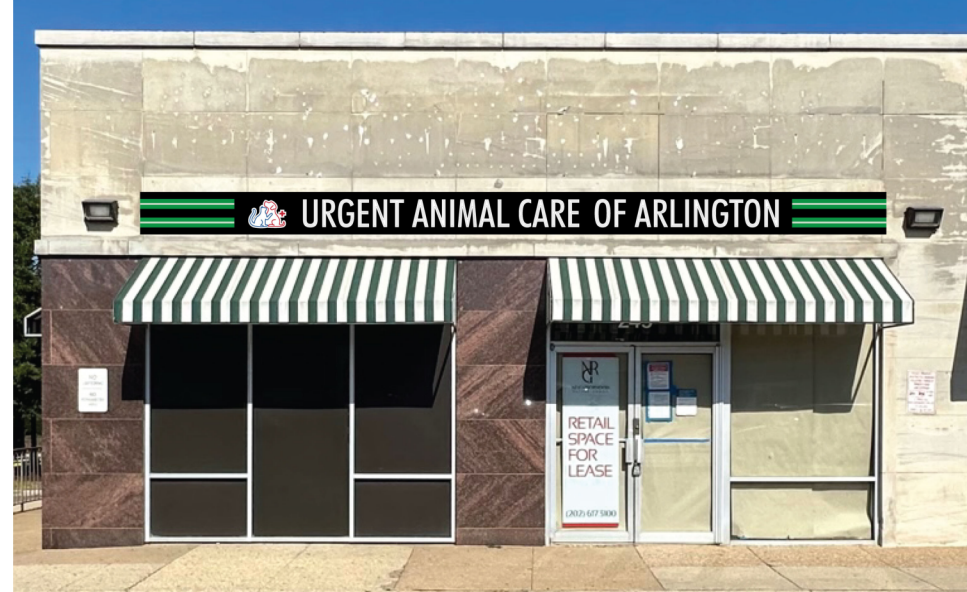
PROPOSED SIGNAGE - VIEW FROM GLEBE RD

SIGNAGE TO BE FABRICATED TO ALIGN TO THE PREVIOUS SIGNAGE LOCATION AS INDICATED BY DISCOLORATION ON BUILDING FACADE. SIGNAGE TO BE FABRICATED TO BE CENTERED BETWEEN EXISTING TO REMAIN BUILDING LIGHTING. EACH SIGN TO INCLUDE NO MORE THAN (8) TRANSFORMERS PER THE SPECIFICATION AS INDICATED BELOW. TRANSFORMER TO BE CONNECTED TO POWER ON INTERIOR OF BUILDING. GENERAL CONTRACTOR TO COORDINATE WITH SIGNAGE MANUFACTURER TO ENSURE PROPER INSTALLATION OF SIGNAGE.