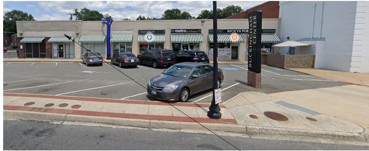
EXISTING STOREFRONT - VIEW FROM GLEBE RD