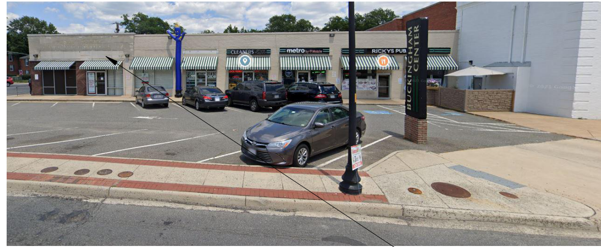
EXISTING STOREFRONT - VIEW FROM GLEBE RD