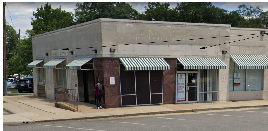
EXISTING STOREFRONT - VIEW FROM CORNER