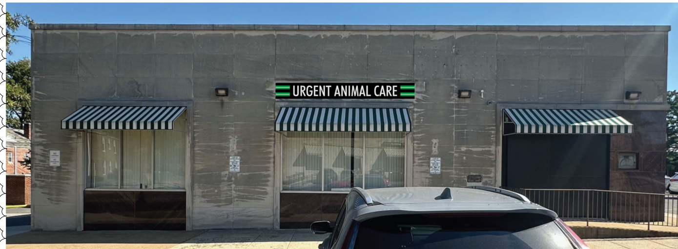
PROPOSED SIGNAGE - VIEW FROM N. PERSHING DR