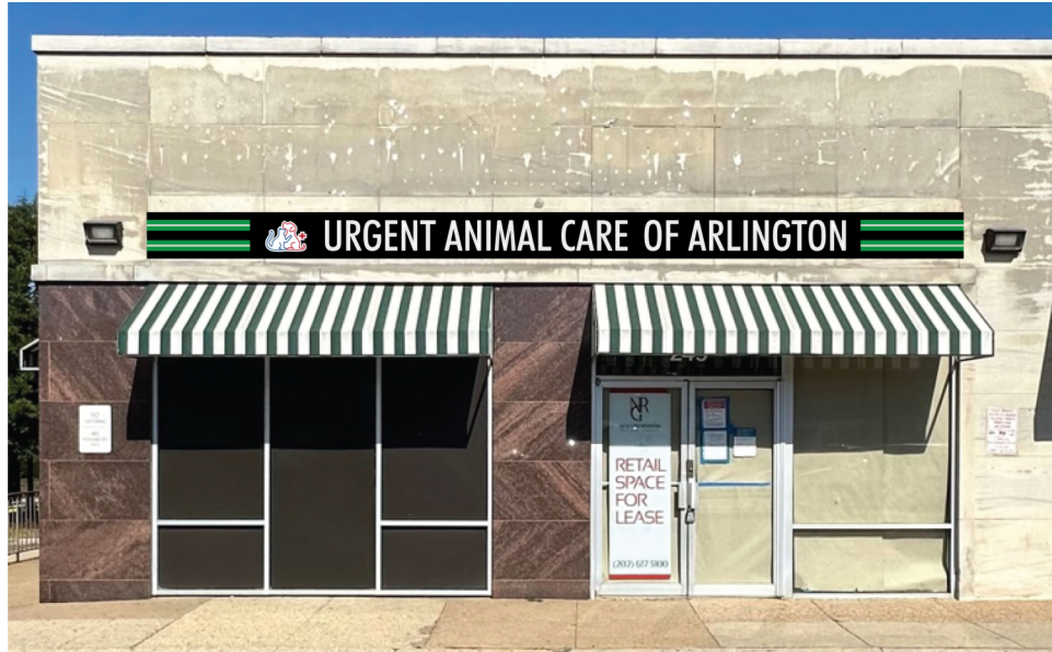
PROPOSED SIGNAGE - VIEW FROM GLEBE RD