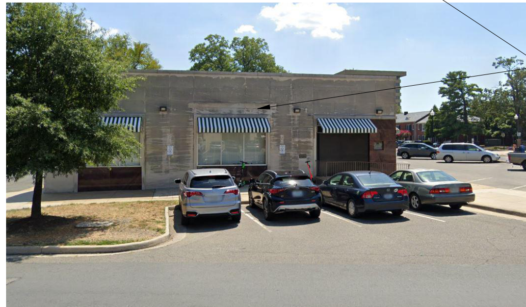
EXISTING STOREFRONT - VIEW FROM N. PERSHING DR