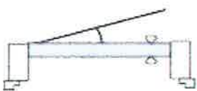
EXTERIOR Left-Hand Inswing