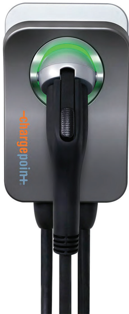
ChargePoint® Home Flex