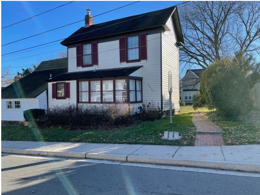
Stones placed between brick path and sidewalk