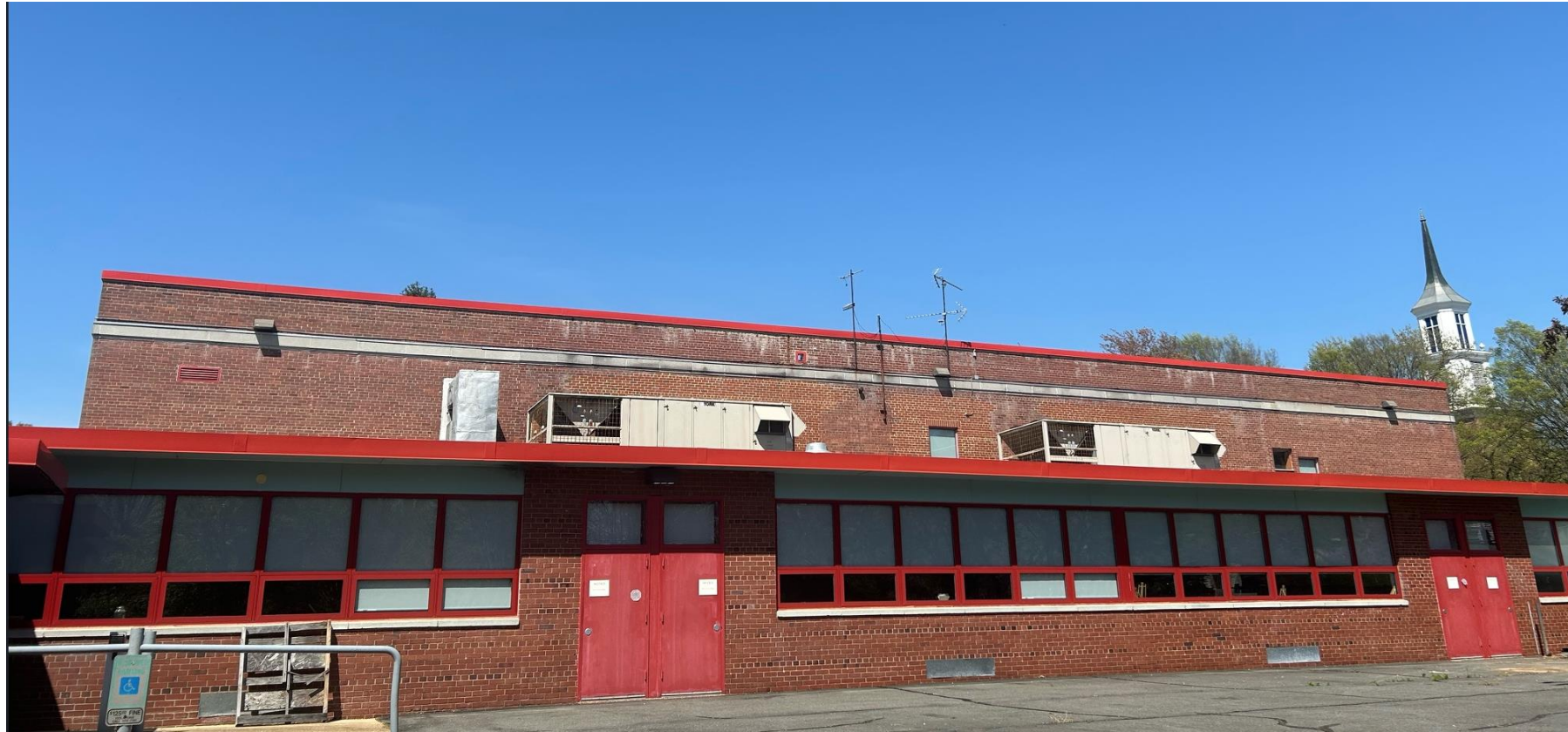
Rear parapet of original Nelly Custis School (with Mid-century addition in front)