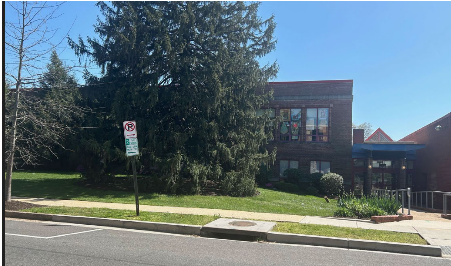
Northwest Corner of original Nelly Custis School (with historic evergreen in front). Mid-century addition to the right/west of the historic building.