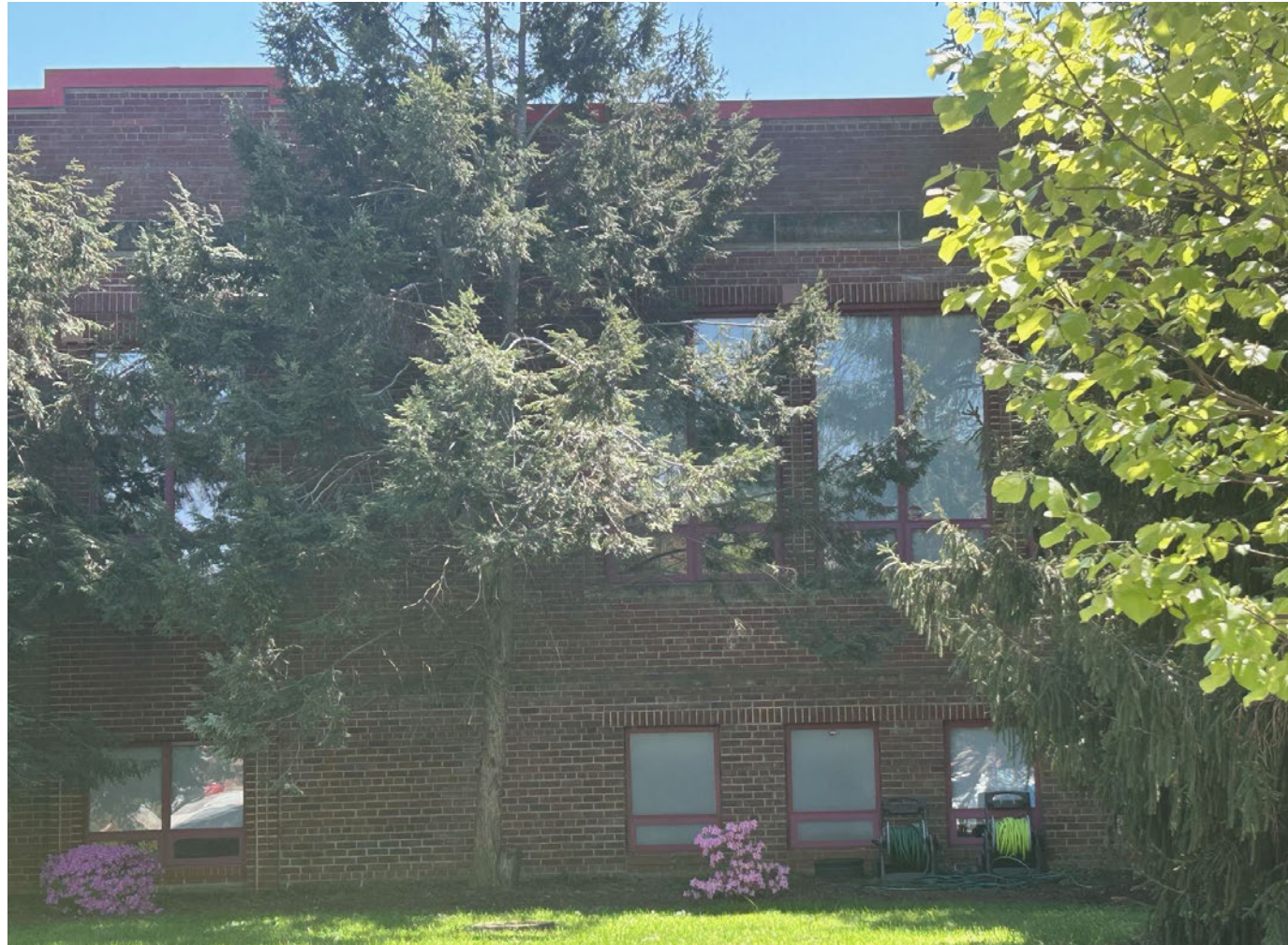
Detail of 1923 brickwork which has been well preserved.