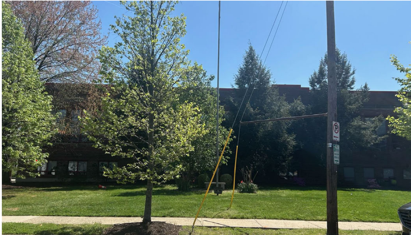
Northeast corner and North Side of original Nelly Custis School – the historic main entrance is hidden by trees, but is visible on the roof line.