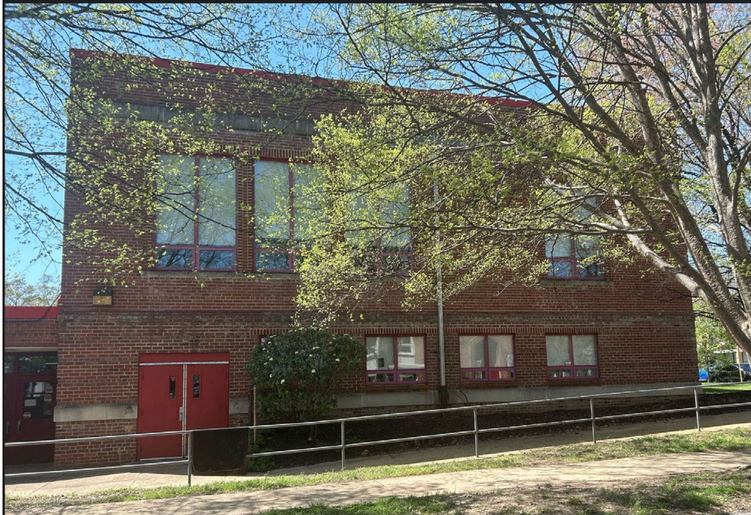
East Side of historic Nelly Custis School