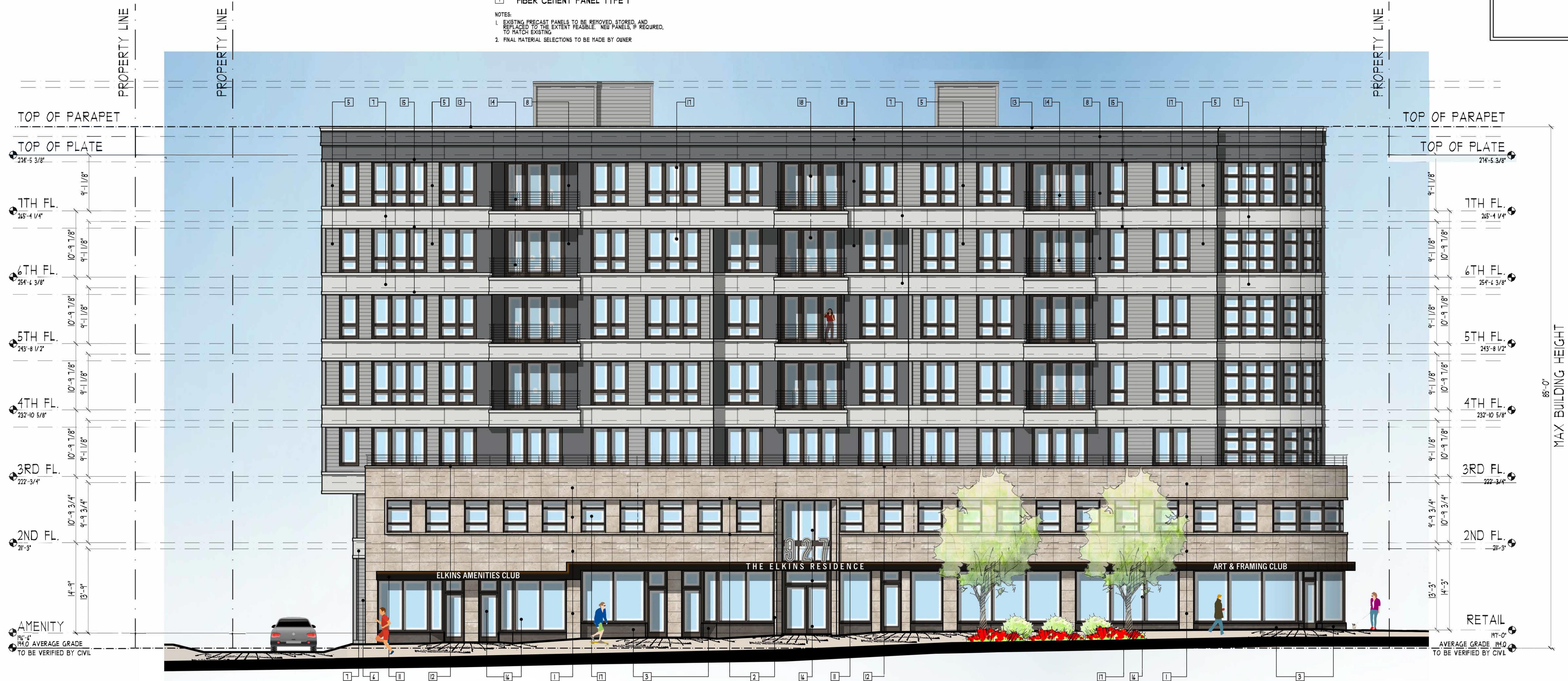
1 WEST ELEVATION - S. WALTER REED DR. A.2.00 1/8" = 1'-0"

NOTES: 1. EXISTING PRECAST PANELS TO BE REMOVED, STORED, AND REPLACED TO THE EXTENT FEASIBLE. NEW PANELS, IF REQUIRED, TO MATCH EXISTING. 2. FINAL MATERIAL SELECTIONS TO BE MADE BY OWNER.