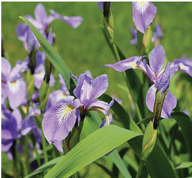
Blue flag iris