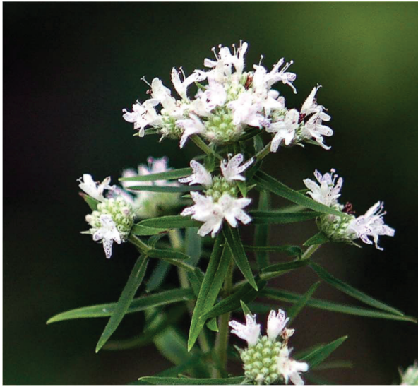
Virginia mountain mint