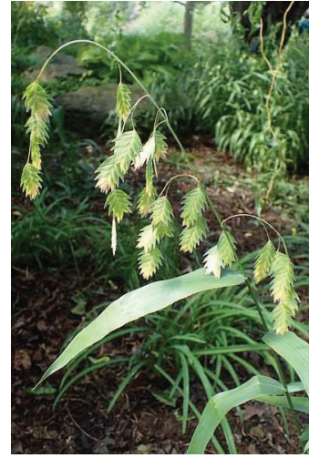
Northern sea oats