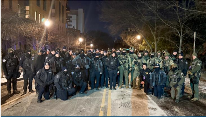
ACPD joined DC Police and law enforcement agencies from across the country in ensuring the safety and security of the Presidential Inauguration on January 20.