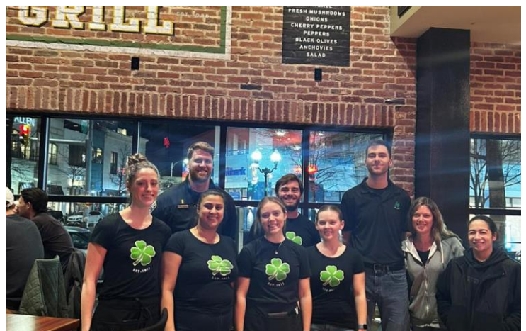
Following the aircraft collision on January 29, businesses across the community, including Colony Grill and Chick-Fil-A in Crystal City, provided dinner to officers. Thank you for your continued support!