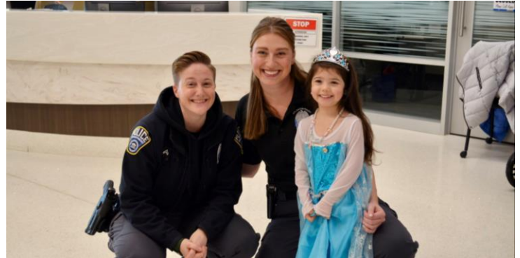
The Community Engagement Division hosted a Frozen double-movie feature on January 11 at the Courthouse Library complete with hot cocoa, popcorn and a surprise appearance from Elsa herself!