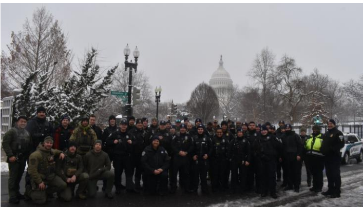
Members of ACPD and ACFD, along with other law enforcement partner agencies, provided enhanced security at the U.S. Capitol during the certification of the 2024 election on January 6.