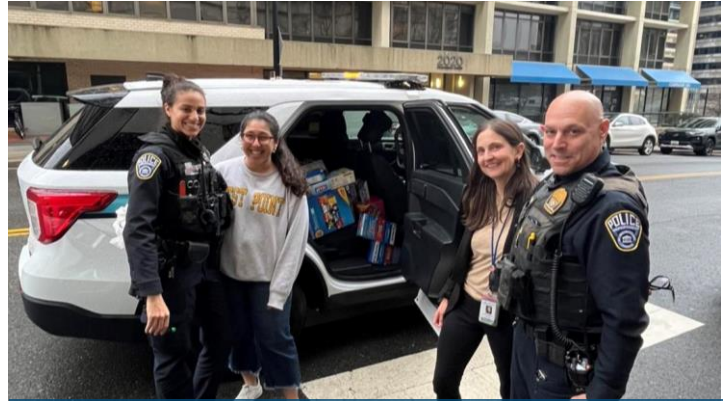
A community member dropped off snacks and other food items as a show of appreciation for first responders working and supporting the aircraft collision operations on the Potomac River.