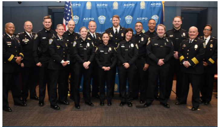
On January 14, ACPD held a promotional ceremony to recognize officers recently promoted to the ranks Lieutenant, Sergeant and Corporal. Please join ACPD in congratulating each of these officers!