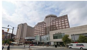
② FASHION CENTRE AT PENTAGON CITY