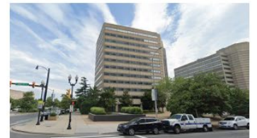
⑧ 12TH ST S & S HAYES ST ROAD INTERSECTION