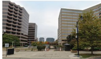
① S HAYES ST LOOKING EAST