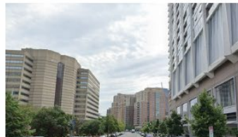
④ 12TH ST S LOOKING EAST