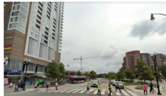
③ S HAYES ST LOOKING SOUTH