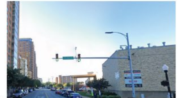
⑤ S FERN ST LOOKING SOUTH