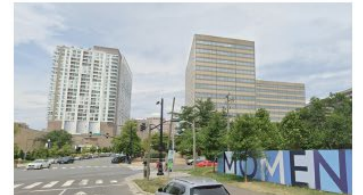
⑦ 12TH ST S LOOKING WEST