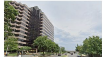
⑥ S FERN ST LOOKING NORTH