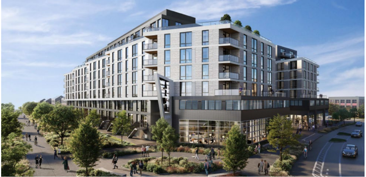
Figure 3--- Arlington Boulevard looking south