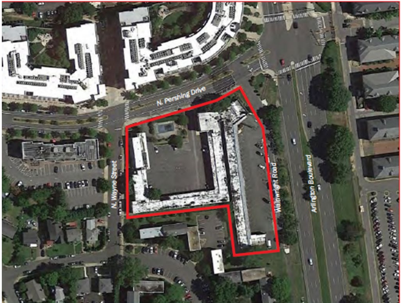
Figure 1—Project site

The approximately 2.4-acre site is located in Lyon Park. The site is bordered by North Pershing Drive (north), Arlington Boulevard (east), the Washington-Lee Apartments (south), and North Wayne Street (west). The site is located in the Lyon Park Citizens Association area.