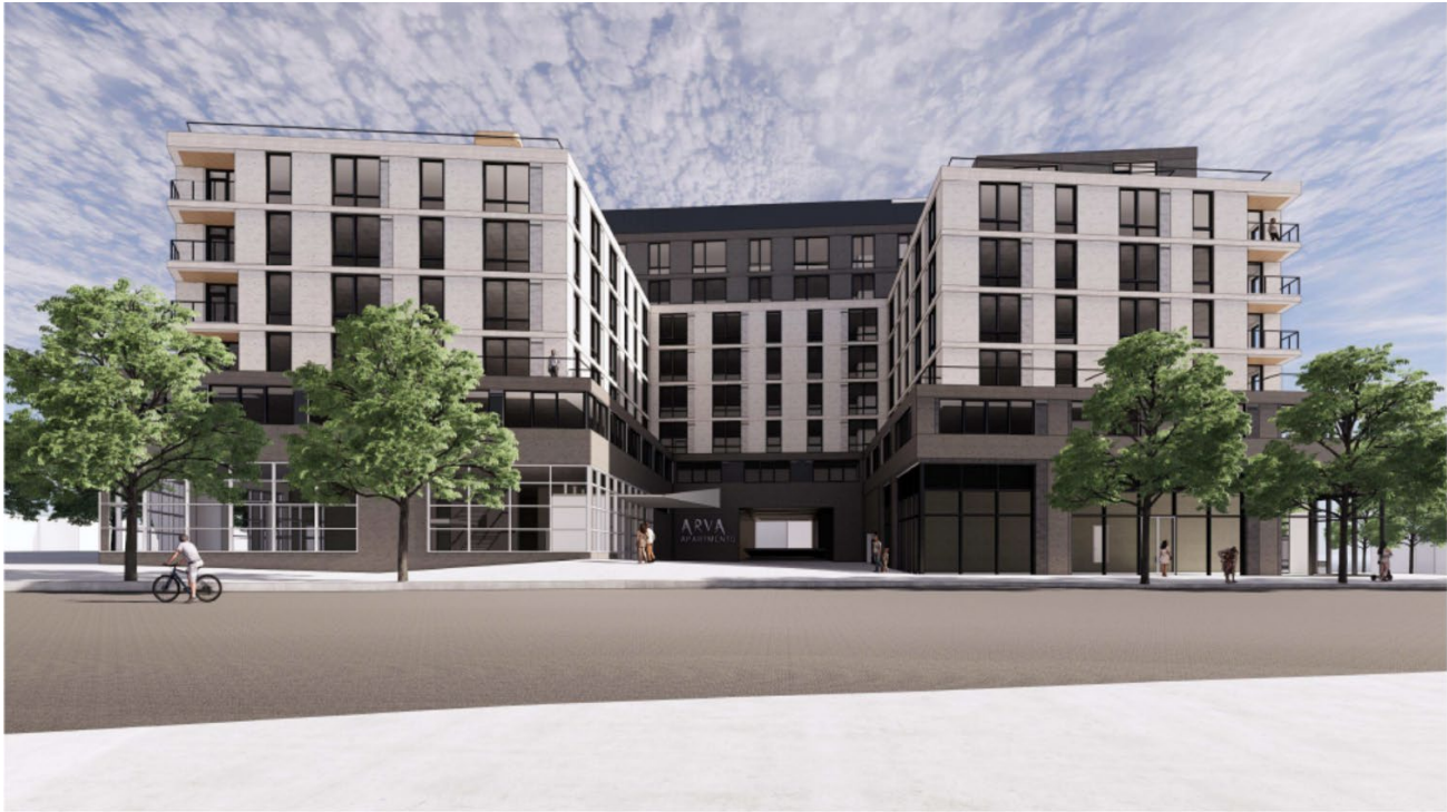
CONTEXT VIEW - PERSHING DRIVE - LOOKING INTO THRU-BLOCK ACCESS Figure 7

Public Space: The developer proposes to dedicate to the County as a public easement an approximately 10,000 square foot public space. The County Department of Parks and Recreation will lead a public park master plan process to design the site.