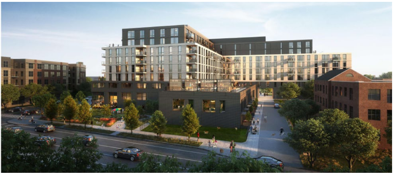
3| CONTEXT VIEW - MEWS & COURTYARD ON WAYNE ST - LOOKING EAST Figure 4