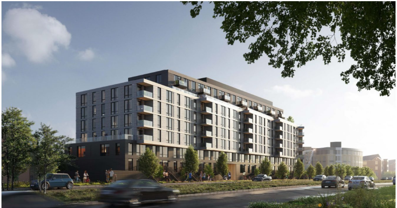
1 | CONTEXT VIEW - ARLINGTON BLVD NORTHBOUND - LOOKING NORTH