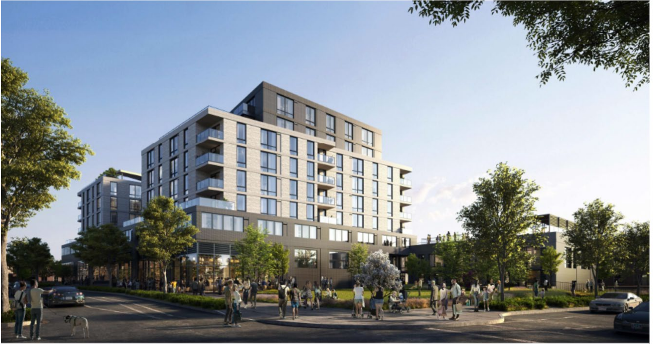
2 | CONTEXT VIEW - OPEN SPACE AT PERSHING DRIVE & WAYNE ST - LOOKING SOUTH EAST