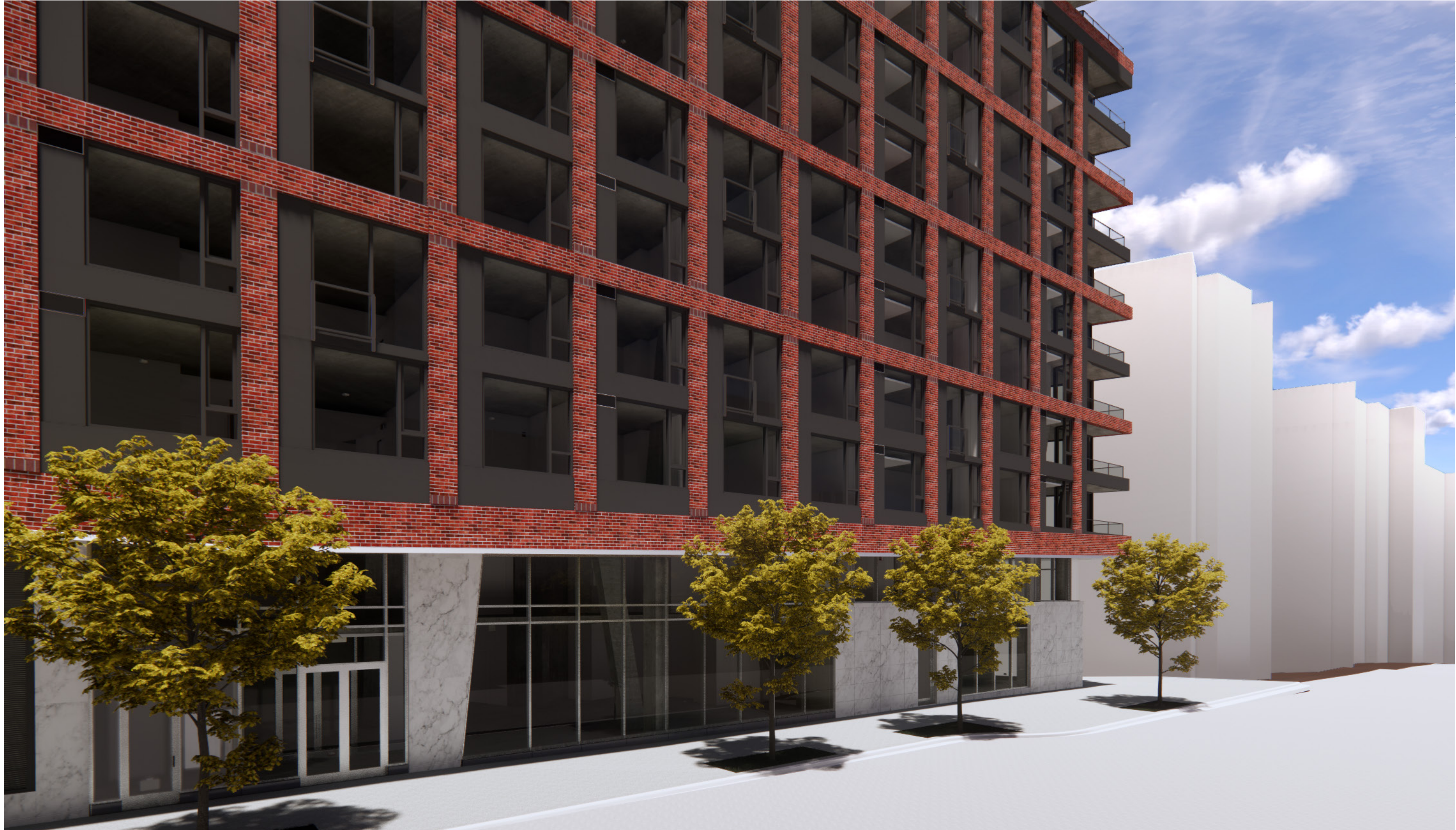
2025 CLARENDON BLVD.