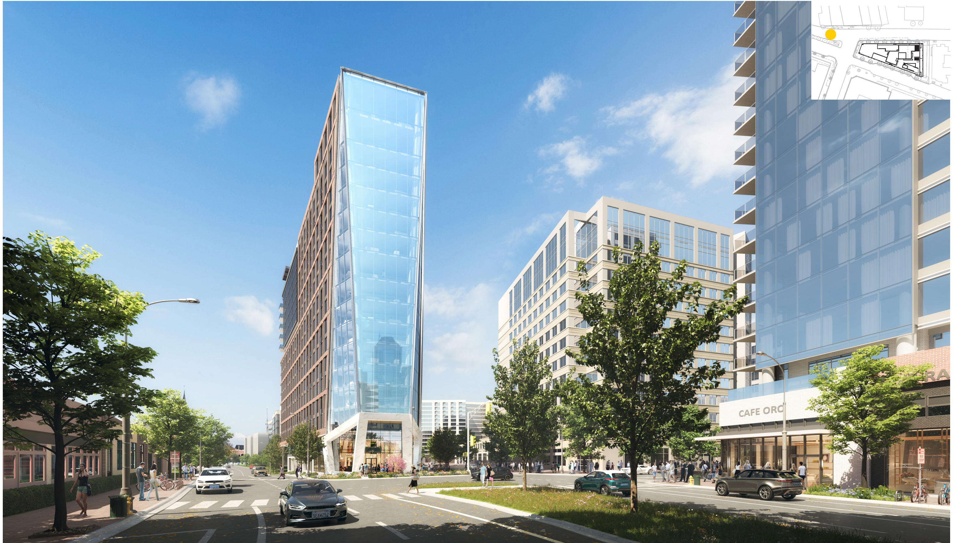
2025 CLARENDON BLVD.