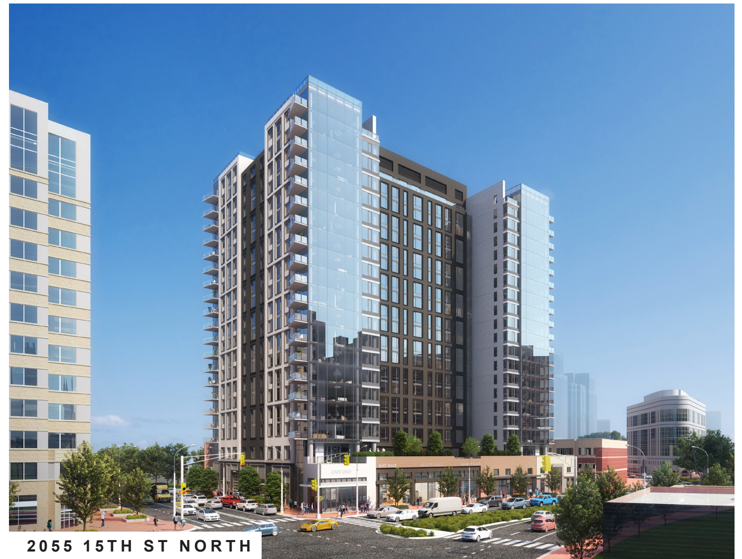
2055 15TH ST NORTH