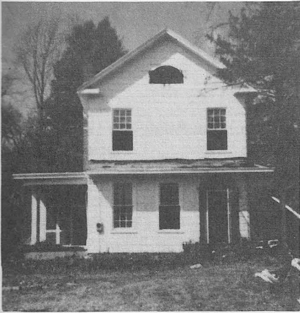
The Tate House, 1994.