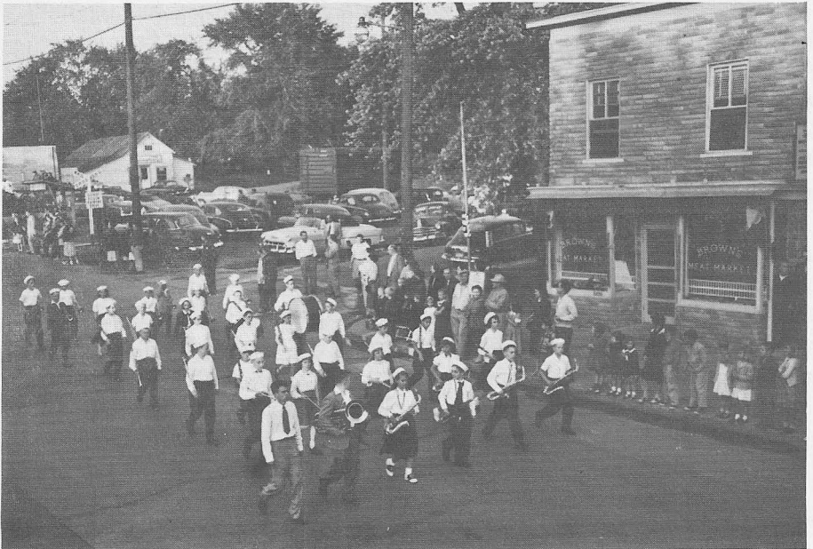
The north side of the Mankin Building in 1953.

In 1914, Mitchell's Barber Shop opened in this portion of the building, and was there for at least 22 years. 24 The Elite Self-Service Laundry and Dry Cleaning Branch picked up clothes there. In 1957, the Lynn Realty Company was at 6860; in 1961, A&F TV and Appliances occupied the space. This space