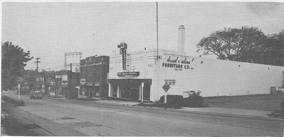
Business establishments along Lee Highway south of the intersection of Lee Highway and Washington Boulevard in the early 1960s; the former Lee Theater (Miller and Wrenn Furniture in the Photo) and the Masonic Building are in the closest buildings to the intersection.