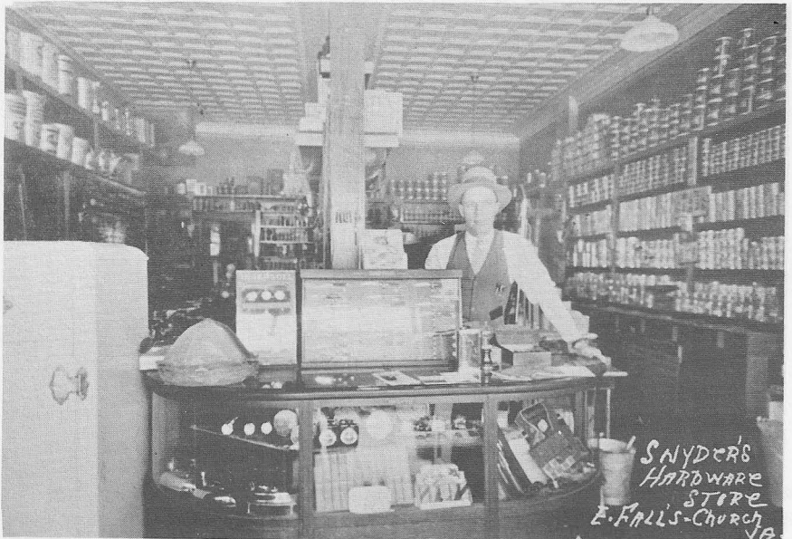
The interior of Snyder's hardware Store, circa 1930s.

Immediately west of Elliot's store, on the adjacent lot along North Fairfax Drive, the P.B. Nourse Livery, Feed and Sale Stable stood in the first days of J.C. Elliot's relocation to 6847. It appears in photos from 1904 and 1910 and