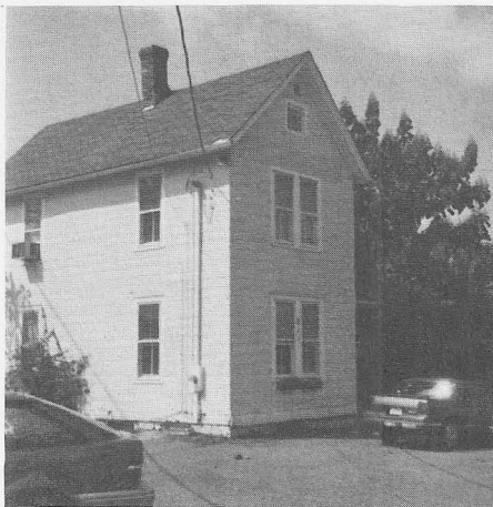
IEKEL The Kimball House at 6830 North Fairfax Drive, east and north sides, in 1990.