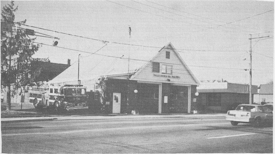
The East Falls Church Volunteer Fire Department, 1995.)