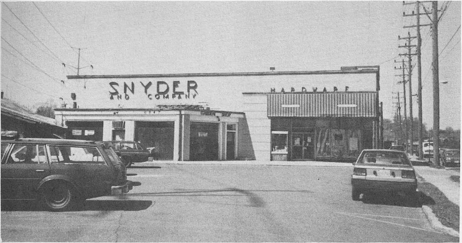
The new Snyder's building in 1991.