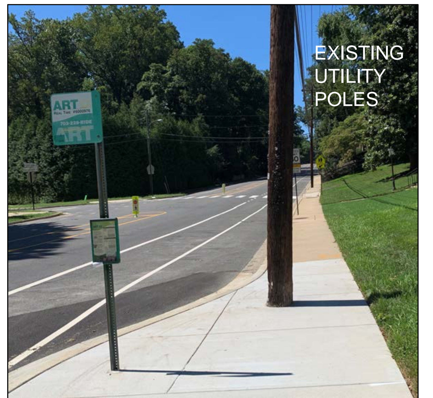
Utility pole in photo above located northwest of the intersection of Lorcom Lane and Nelly Custis Drive.