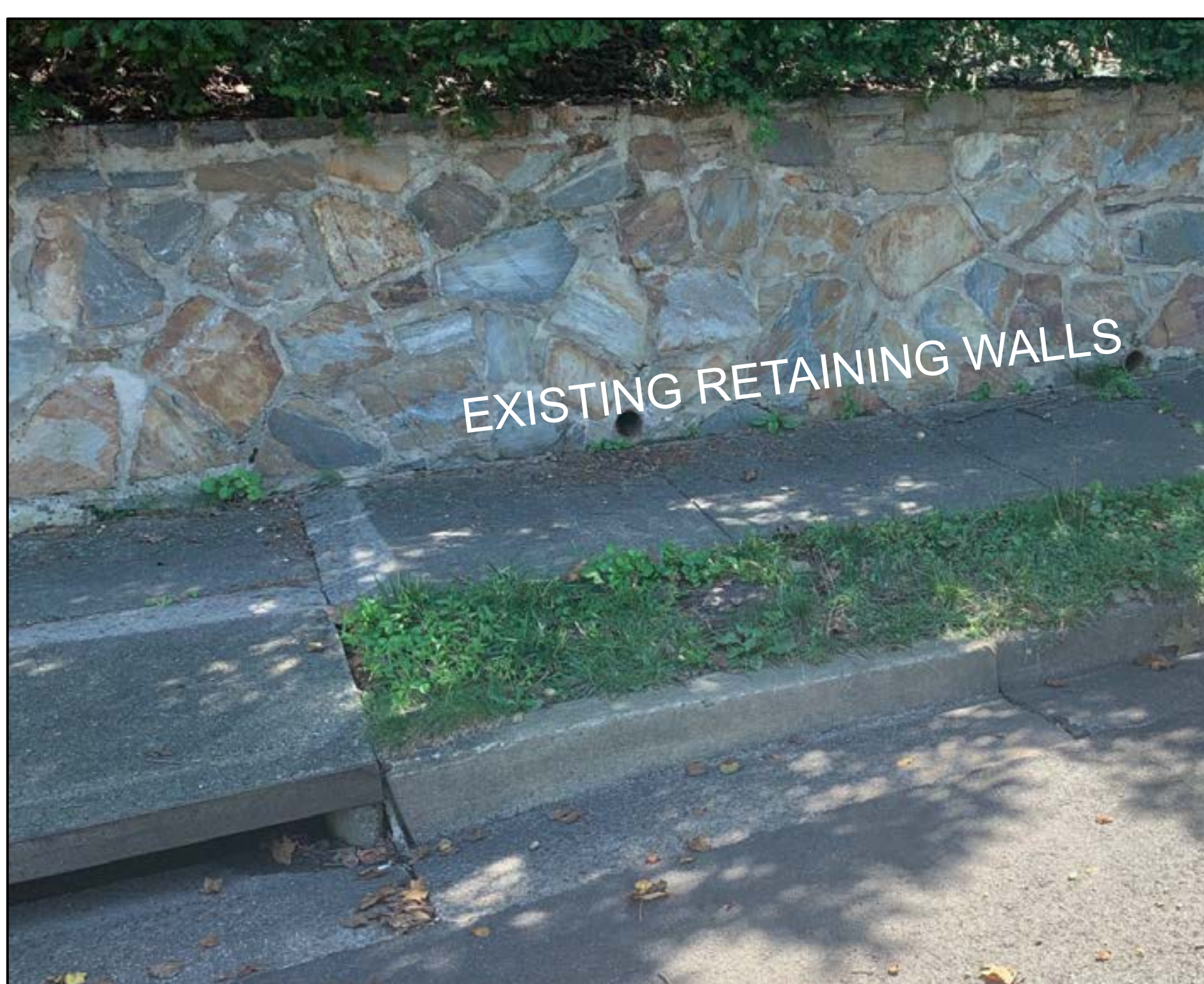
Retaining wall in photo above located south of the intersection of Lorcom Lane and N Nelson Street.