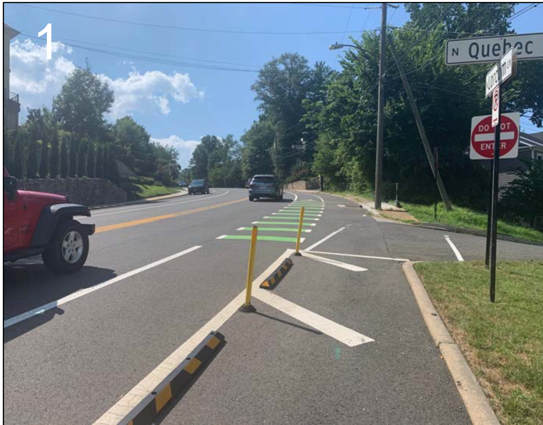
Temporary walkways on the north side of Lorcom Lane as part of the Vision Zero pilot walkability project. Photo shown is southeast of the intersection of Lorcom Lane and N Quebec Street.