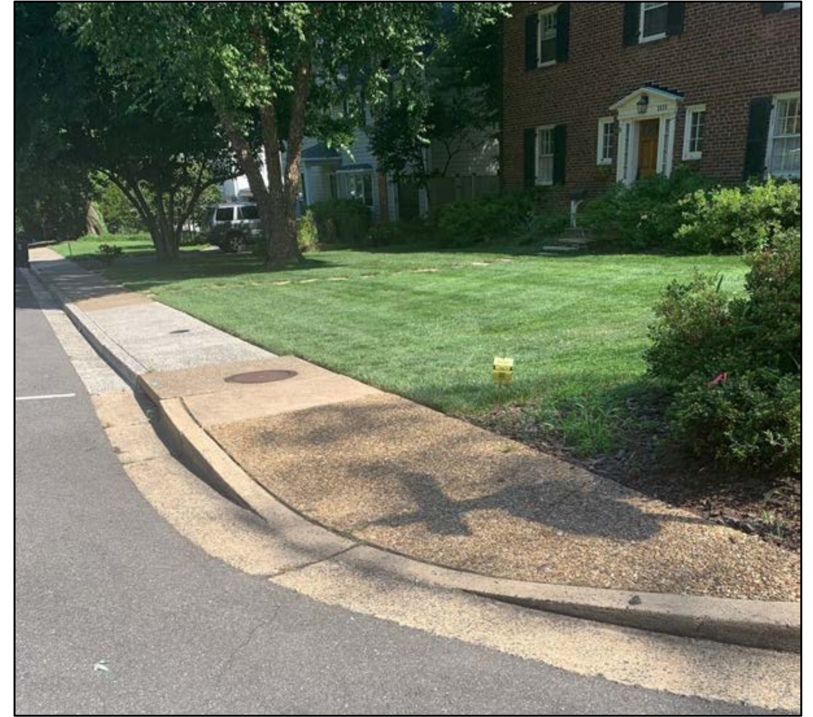
An example of the condition of curb ramps on Lorcom Lane. Photo shown is southeast of the intersection of Lorcom Lane and N Quincy Street.