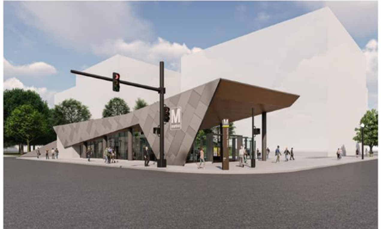
New entrance location at 18 th Street South & Crystal Drive