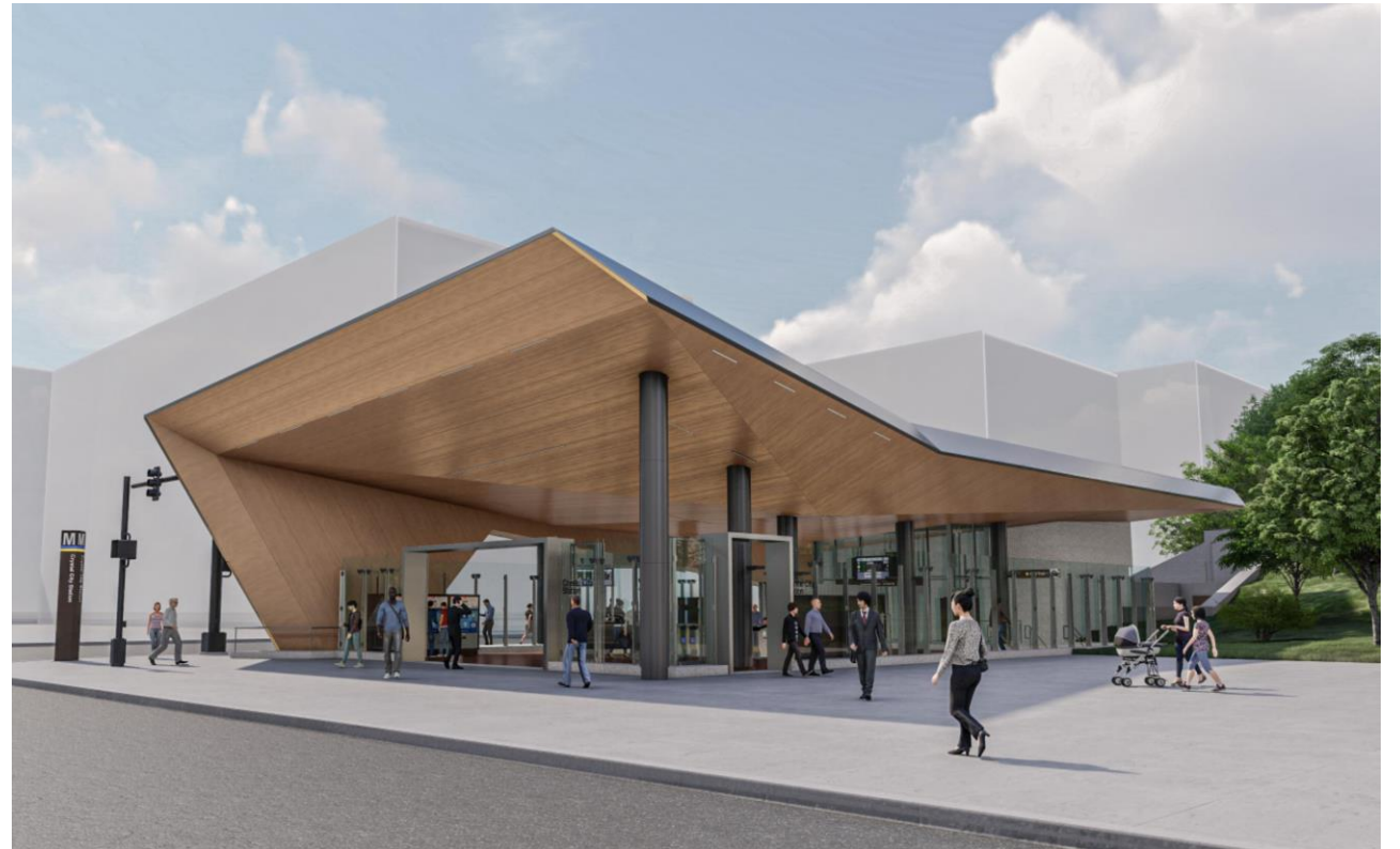
New entrance location at 18 th Street South & Crystal Drive looking southwest