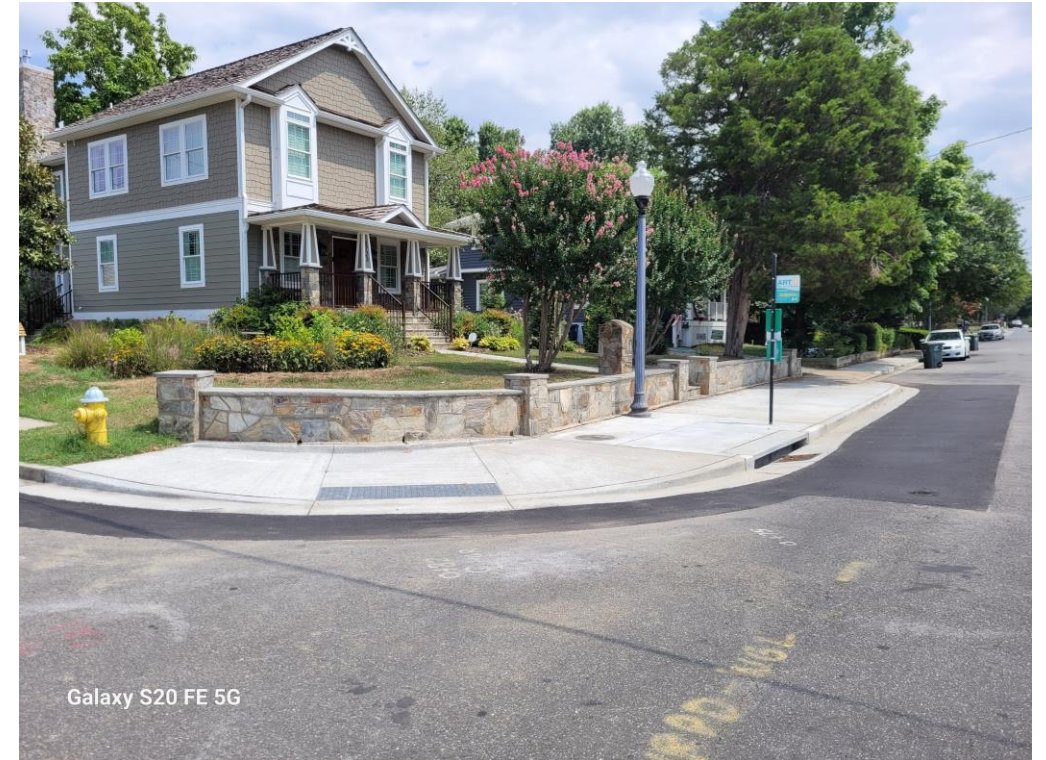
Bus Stop at S Oakland St and 16 th St S.