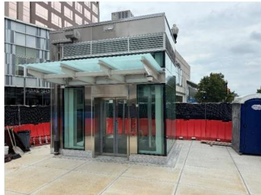
New elevator located at 12th Street S and Hayes Street