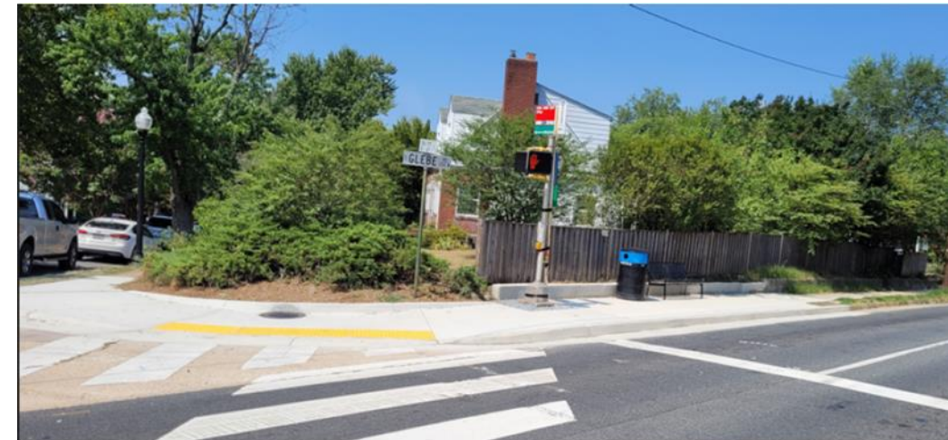
Bus Stop at 2 nd St S and S Glebe Road - Before (top) and After (Bottom)