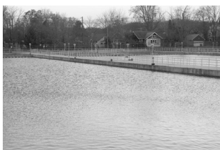
U.S. Environmental Protection Agency

Some people may be more vulnerable to contaminants in drinking water than the general population. Immuno-compromised persons such as persons with cancer undergoing chemotherapy, persons who have undergone organ transplants, people with HIV/AIDS or other immune system disorders, some elderly, and infants can be particularly at risk from infections. These people should seek advice about drinking water from their health care providers. EPA/CDC guidelines on appropriate means to lessen the risk of infection by Cryptosporidium , Giardia , and other microbial contaminants are available from the Safe Drinking Water Hotline at 1-800-426-4791.