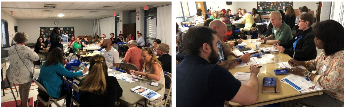
Figure 12: Arlington Census Partner Training