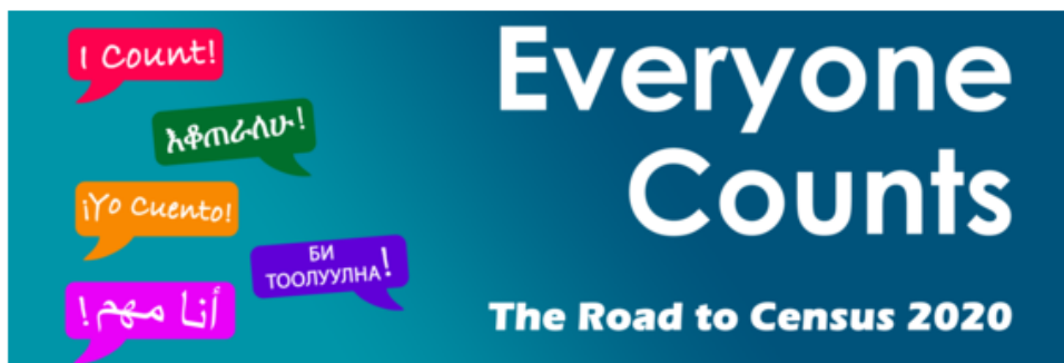
Figure 14: Everyone Counts Newsletter

Fill out your census at www.my2020census.gov TODAY!