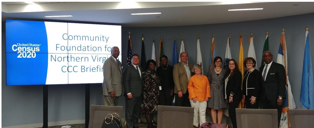
Figure 15: Regional Partners, Northern Virginia Community Foundation

The Northern Virginia Community Foundation also formed a Complete Count Committee that included Arlington, Alexandria, Fairfax, and Prince William Counties. The Foundation was instrumental in developing regional messaging, sharing best practices, and tapping business partners.