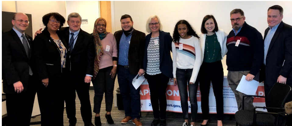
Figure 16: Crystal City Area Census Office Opening

Collaborative activities included outreach at key County events, shared presentations at local partner organizational meetings, outreach to group quarters, coordination with multifamily property managers, and recruiting volunteers and language interpreters for Census Questionnaire Assistance Pop Ups.