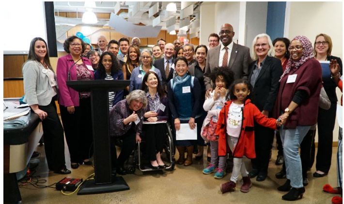
Figure 9: Arlington Complete Count Committee (4/1/19)