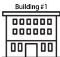
The Arlington Way Apartment Complex (complex name)

123 Arlington Way Boulevard (complex address)