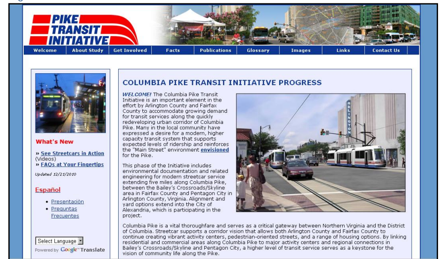
Figure 6.3-1: Columbia Pike Transit Initiative Website

A website, http://www.piketransit.com , was created to keep interested parties up-to-date on the progress of the project. It includes an overview of the study, current status, a fact sheet and frequently-asked questions page, publications, a glossary, maps, images from the project, links, contact information, suggestions on ways the public can get involved with the project, and Spanish translations. The website also provides a means for visitors to submit their comments via e-mail to the project team. A sample view of the website is shown in Figure 6.3-1.