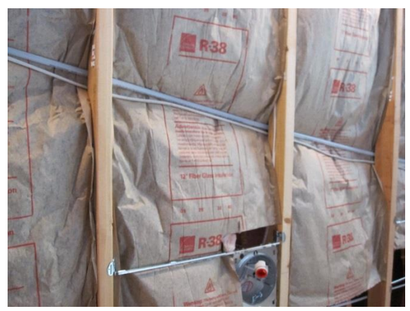
Figure 1 - This faced fiberglass batt insulation was incorrectly installed; it should be cut to fit around wiring and obstructions so that it can completely fill the wall cavity without compressions and voids