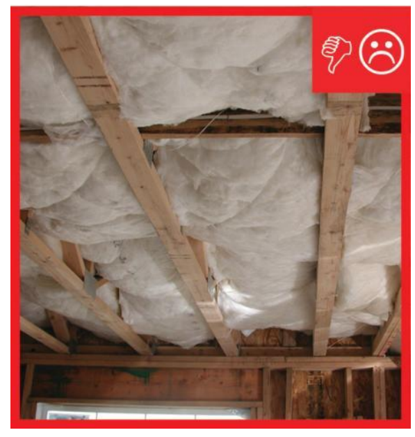
Figure 3 – This unfaced fiberglass insulation has been incorrectly installed due to misalignment, compression, and gaps; it should be cut to fit so that it can completely fill the cavity without any compressions and voids.