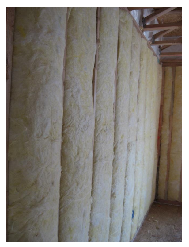
Figure 2 - Unfaced fiberglass batt insulation is correctly installed to completely fill the wall cavities and is sliced to fit around wiring, piping, and other obstructions in the wall cavities without compressing the insulation.